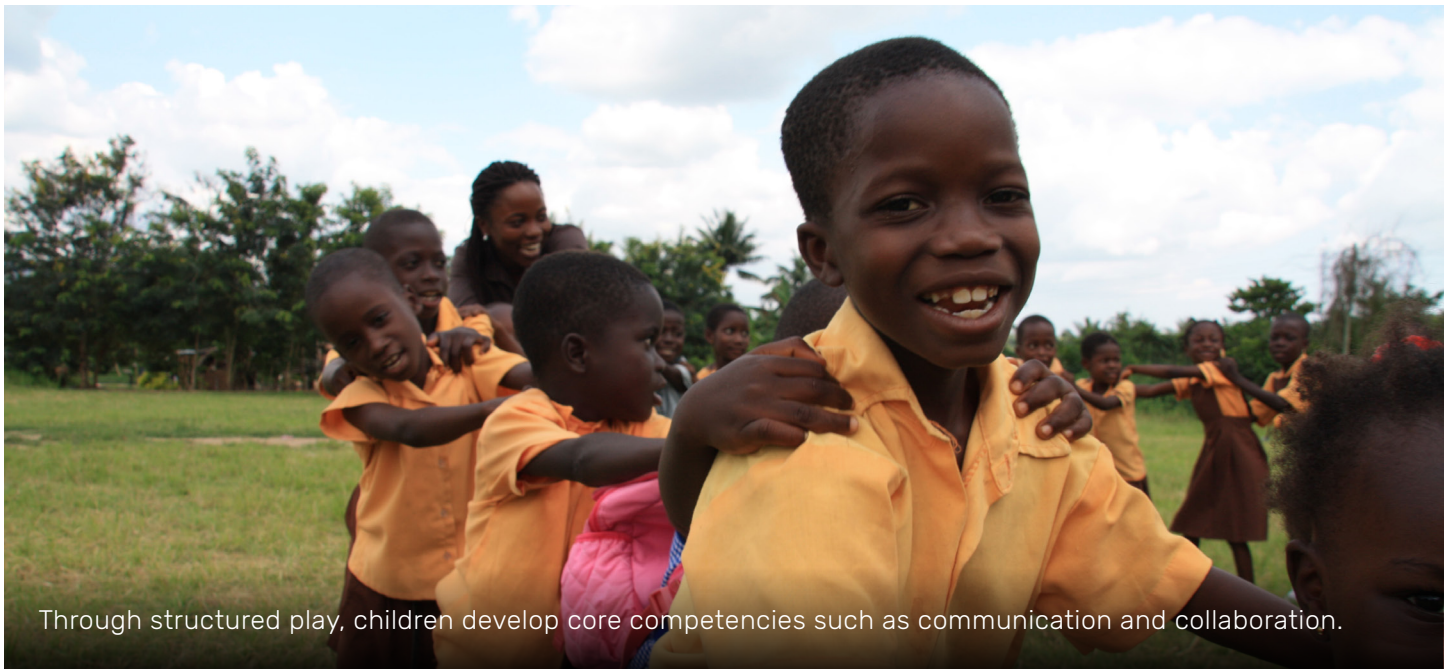
Through structured play, children develop core competencies such as communication and collaboration.

In 2018, Right To Play launched the Gender Responsive Education and Transformation (GREAT) program with the financial support of the Government of Canada provided through Global Affairs Canada. Active in three countries, Ghana, Mozambique and Rwanda, GREAT uses Right To Play's play-based learning approach to remove barriers to education, especially for girls, and to build teacher capacity to improve learning outcomes.